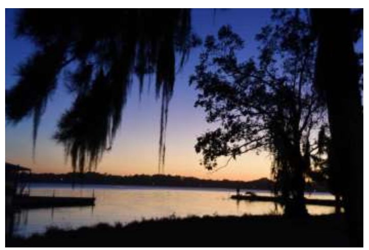
Lake Blackshear glows in the sunset

Against a backdrop of perfect weather and the welcoming atmosphere of Lake Blackshear Resort, the enthusiasm of being together again was contagious. Smiles, good feelings, and warm greetings to long-time friends and co-workers were ubiquitous during the 2022 Annual Meeting. All in all, it was a terrific meeting!