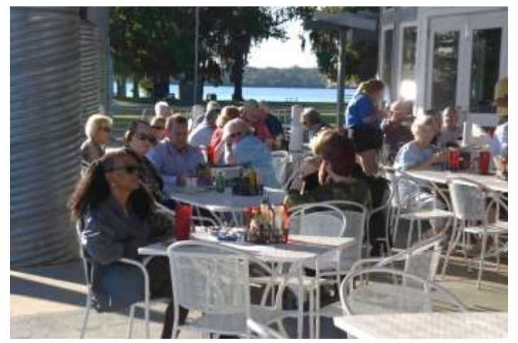
Members having a good time at the Welcome Reception

On Tuesday, members again attended the workshops of their choice in the morning before convening in the auditorium for lunch. The staff at LBR provided us with exceptional service and a great buffet with turkey and dressing, pork tenderloin, and all the fixings.