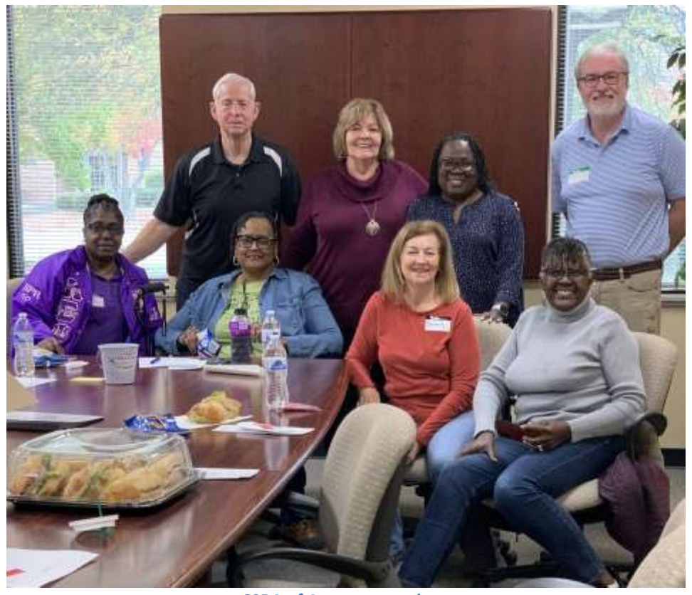
CSRA of Augusta members

*A membership drive will take place on 12/09/23 at 9:30 am at the Cracker Barrel on Park West Drive.