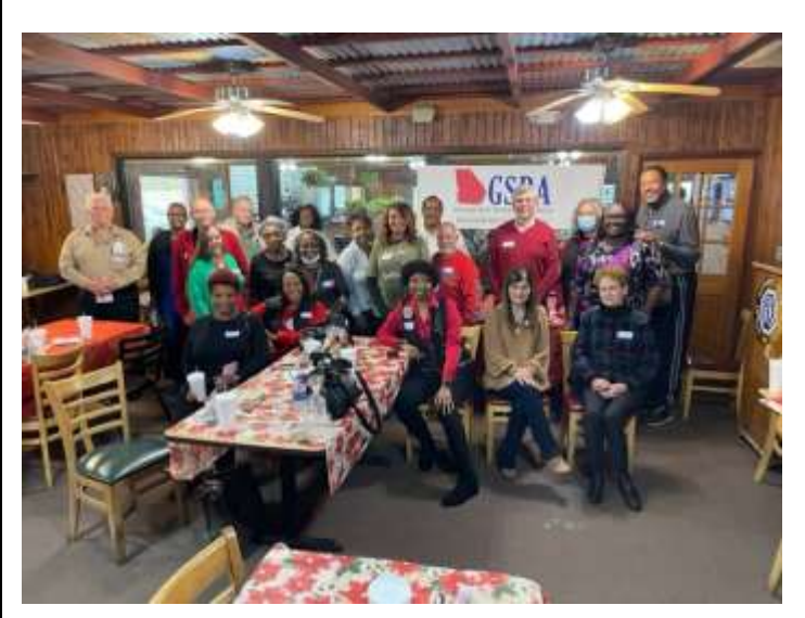
Macon/Middle Georgia members at the December meeting

Macon/Middle Georgia's next meeting is March 11th at Ole Times Country Buffet on Gray Highway in Macon.