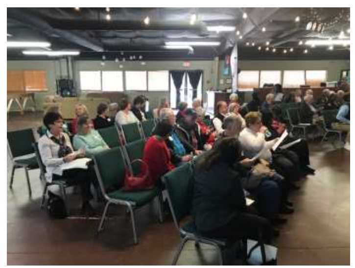
East Metro members convene for December meeting

A highlight of the meeting was having three new members join.