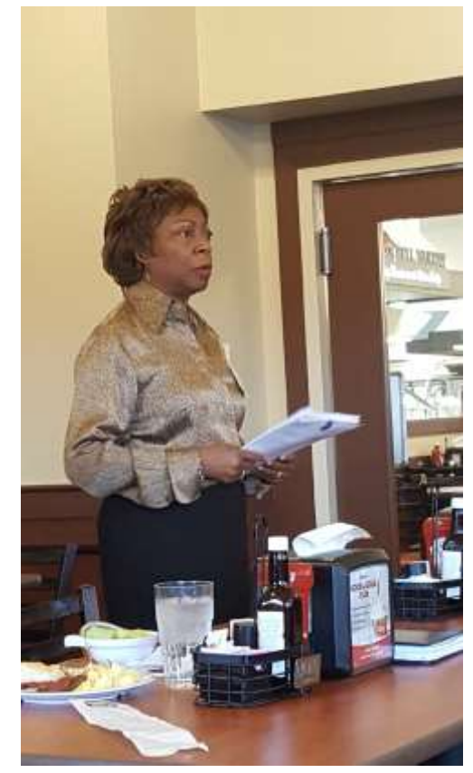
Senator Sims addresses SW Georgia members

On December 13th members of the SW Georgia chapter met at the Golden Corral restaurant in Albany. Senator Freddie Powell Sims updated the membership on the recent special legislative session and the upcoming 2019 legislative session. Other discussion topics included: In coming Governor Kemp, SW Georgia's recovery from Hurricane Michael, COLAs and the State Health Benefit Program. The program ended with Senator Sims responding to questions from the members.