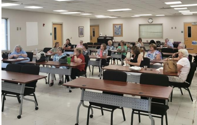
Members of the Augusta/CSRA Chapter at the July meeting